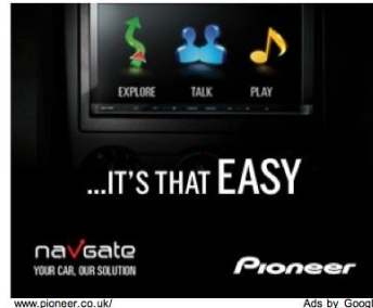
www.pioneer.co.uk/ Ads by Google